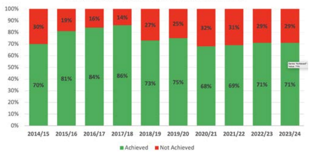
Figure 1: DHA Organisational Performance 2014 to 2024

The organisational performance since 2014 is reflected in Figure 1 below: